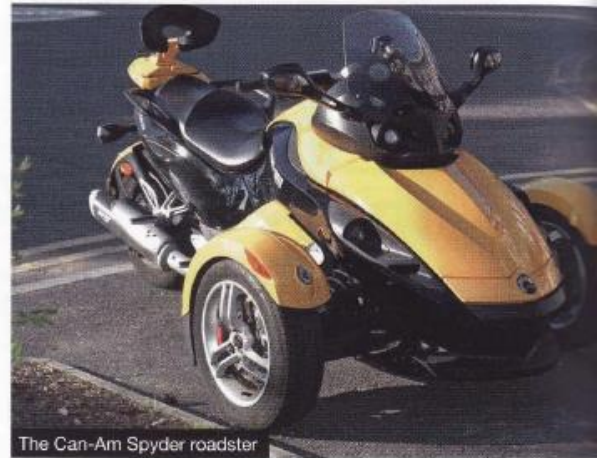
The Can-Am Spyder roadster

number of wheels speed acceleration braking power ease of turning stability (on rough roads) stability (when it turns) storage space comfort excitement safety